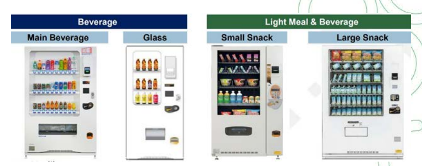
Examples of types of vending machines

(1) No more than 2,522 functional vending machines divided into 1,113 beverage vending machines ("Beverage Type") and 971 food vending machines ("Light Meal & Snack Type") which are located in various places around 2,084 machines and the rest are located in the warehouse in ready-to-use condition. The average usage life of the machine is not more than 4 years, with VDC can be used to continue business immediately, which has a service life of approximately 10 years (Industry has a service life of 7-15 years)